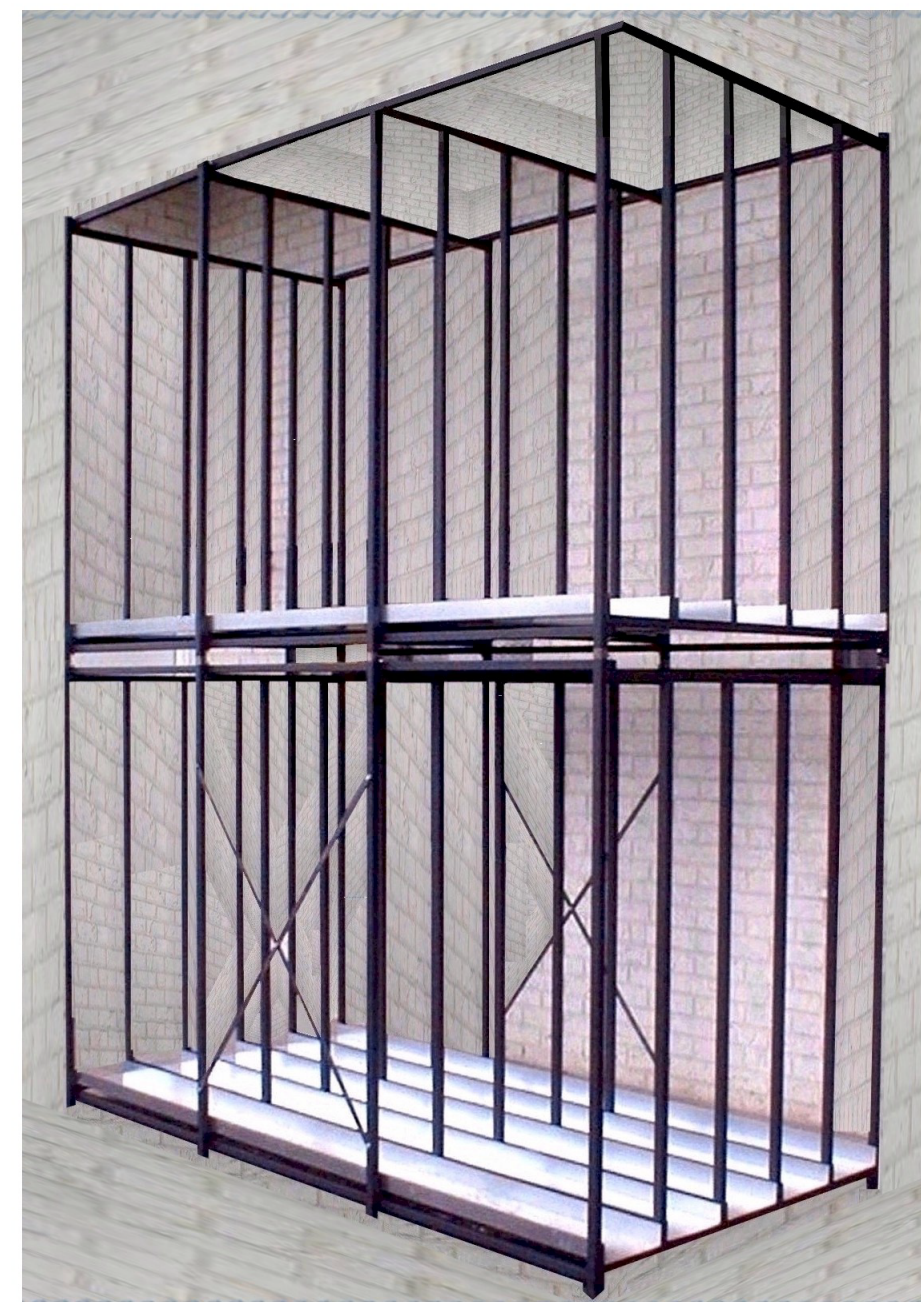
View of Double Stacked Storage Racks